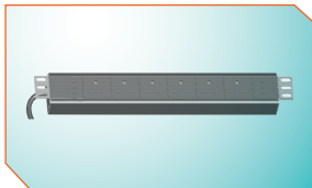
Power distribution unit