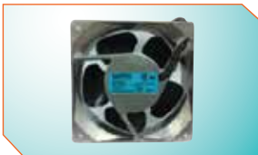
Quality low noise fan