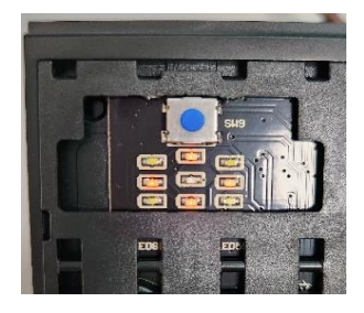
Amber LEDs (4) on (backlight)