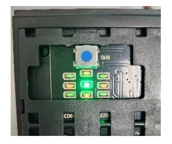
Green LED (1) on when pairing