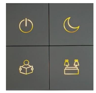
Amber LED backlight