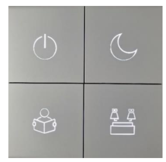
White LED ON when pressed