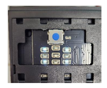
White LEDs (4) on when pressed

(with faceplate removed, top-left corner switch button)