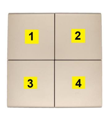
When pairing, blinking Green LED (behind faceplate)