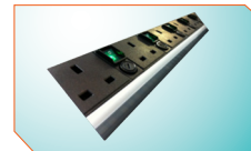
Power Distribution unit