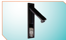
Swing lock set