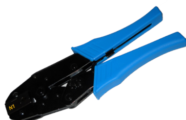
N1 Crimping tool