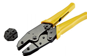
Crimping frame &amp; die cast