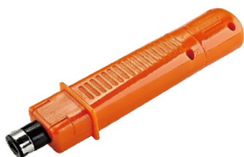
Impact and punch down tool