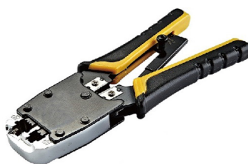
Dual modular plug crimp, strips &amp; cuts tool